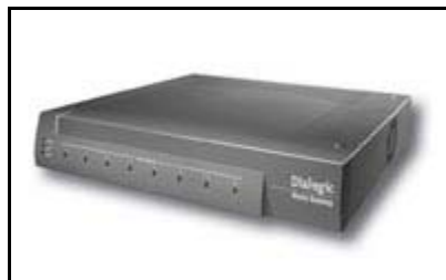
Figure 1. DMG 1000 Series

FirstClass Unified Communications integration with legacy circuit switched PBXs has historically been achieved by using the industry's well respected line Dialogic DSE (digital set emulation) and TDM hardware cards. Moving forward in the VoIP arena, this integration role will be assumed by Dialogic's next generation Media Gateway (DMG) product line. DMGs are standalone units which do not need to be hosted inside a server machine.